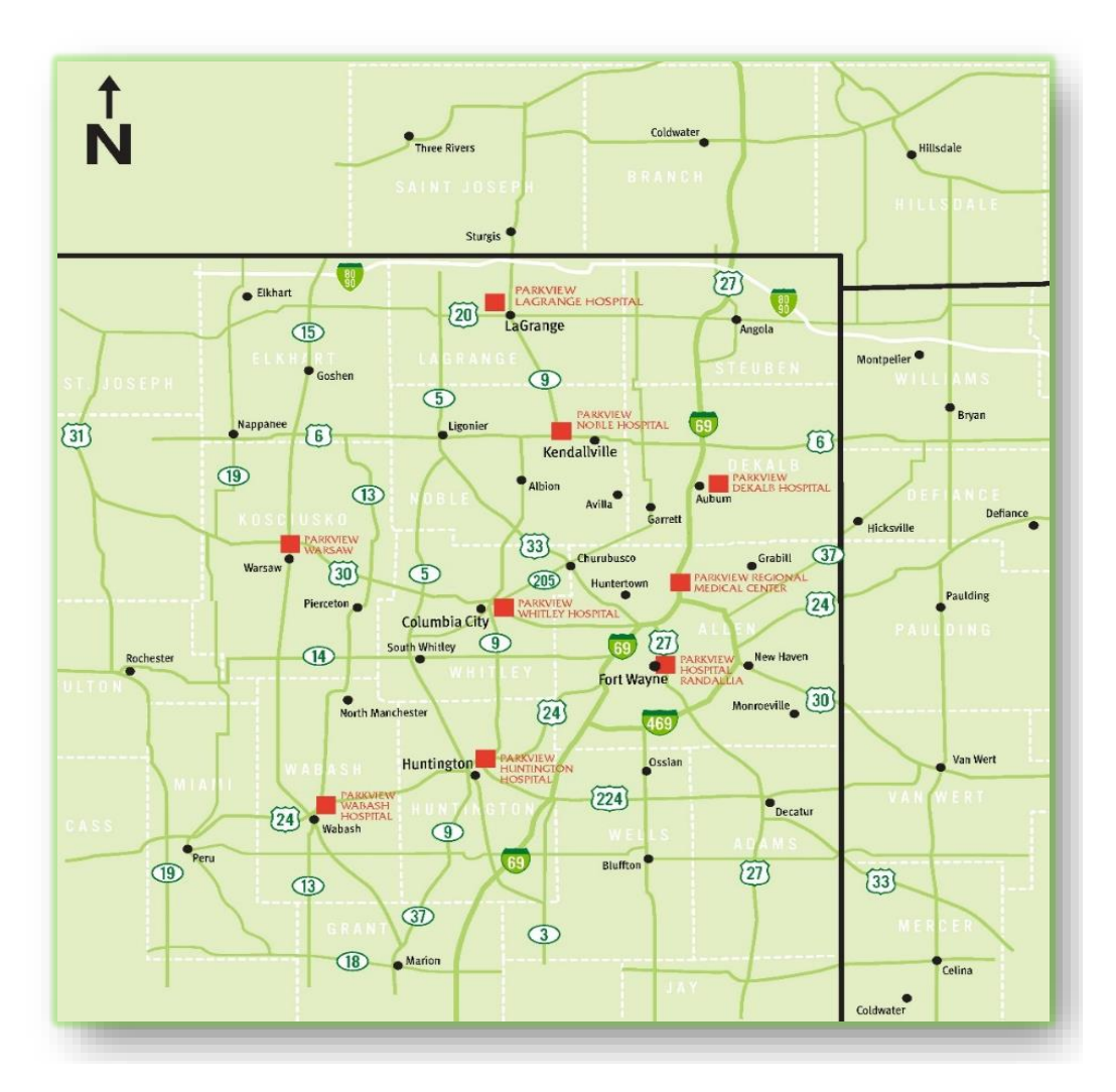
Figure 1: Parkview Health service area

Within the four walls of Parkview Health facilities, there is an emphasis placed on providing "excellent care, every patient, every day." Another integral part of the mission takes place outside the four walls, in the communities that we serve and is accomplished through the community health improvement outreach programs which focus on improving access to healthcare and addressing identified community health needs especially serving vulnerable populations.